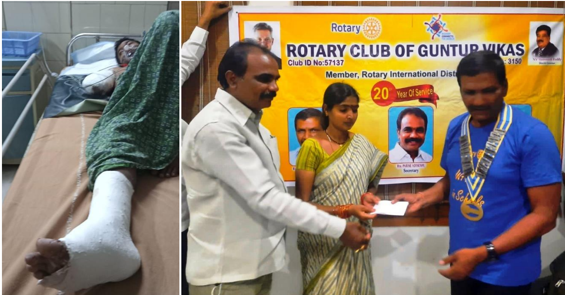
Financial Assistance of Rs.15,000/- was given to wife of a person whose hand was amputated in an accident on 20.03.2021